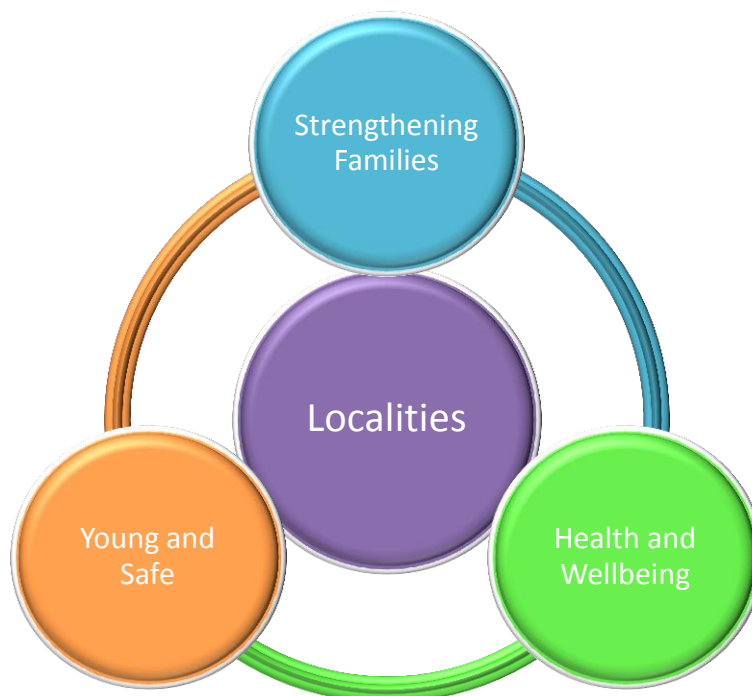
Figure 1 – Thematic model for prevention and early help

Figure 1 below shows how the services will be re-configured so that the majority of our offer will be based in localities with only smaller more specialist teams delivering services across the whole local authority area.